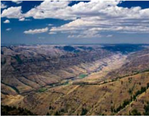
Hells Canyon National Recreation Area along the Oregon-Idaho border

Americans strongly support protecting our land and water: