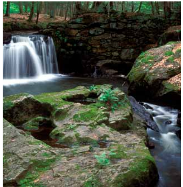
Pine Brooks Falls, Salmon River, in the Silvio O. Conte National Fish and Wildlife Refuge in Connecticut