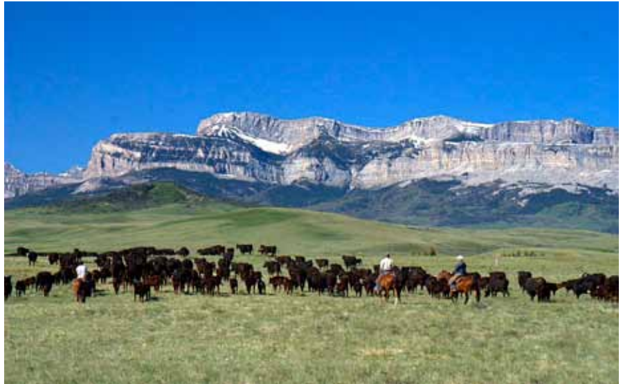
The Land and Water Conservation Fund protects land and water for nature and people. Money from the program also has a positive impact on the economy. More than 500 million people visit national parks and monuments, wildlife refuges, and recreational sites each year, helping local economies. Outdoor recreation provides millions of jobs and contributes $730 billion annually to the U.S. economy. Above: A cattle ranch in the Rocky Mountain Front Conservation Area in Montana